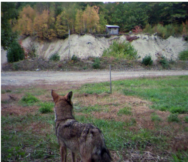
An adult male coyote warily scans the author's hunting shack for human activity. If LD 814 passes, Maine coyotes may lose their fear of people and become more aggressive.