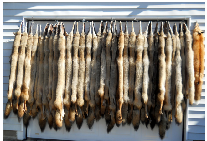
Coyotes taken during the winter of 2016 in Alton, Lagrange and Orneville Twp. The ultimate goal of some coyote advocates is to end all coyote hunting and trapping in Maine.

Some of the following photos and sketches depict predation in a graphic manner. Viewer discretion is advised.